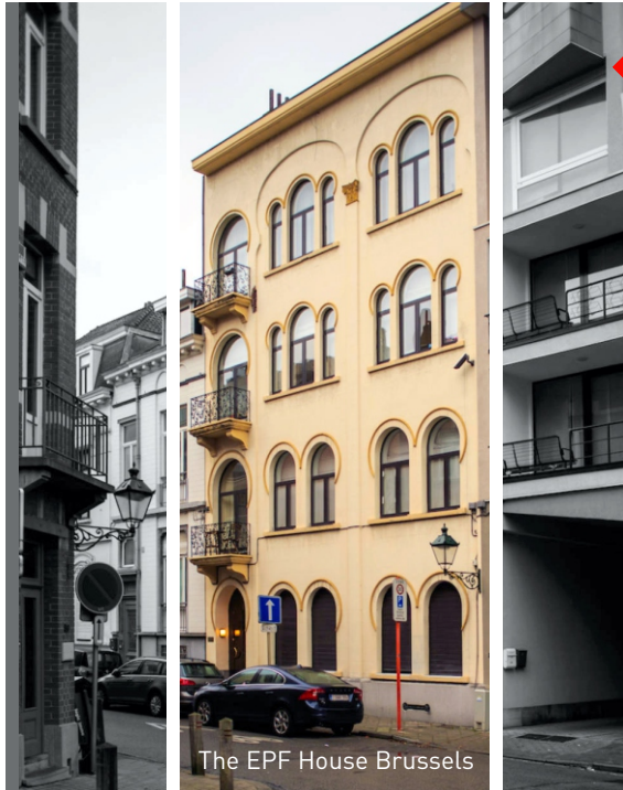
The EPF House Brussels